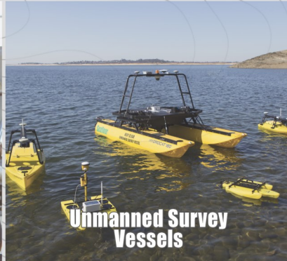
Unmanned Survey Vessels