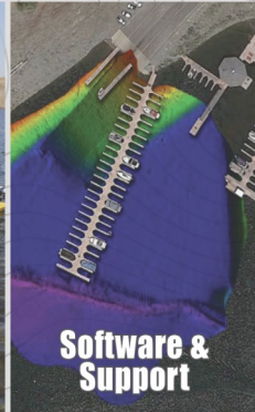
Software & Support