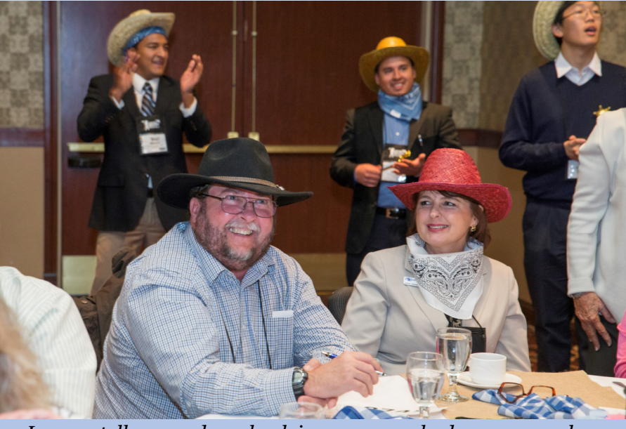
Lemme tell ya pardner, back in 2015 everybody was a cowboy.

Say, didn't we just deliver this organization over 2,000 new members?